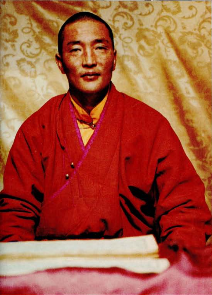
The central Mongolian landscape. From far left: A mother and daughter at home, north of Kharkorin; the Trans-Siberian Express at Zamyin-Üüd, a town in southeastern Mongolia; a monk in a ger temple, Ulaanbaatar.