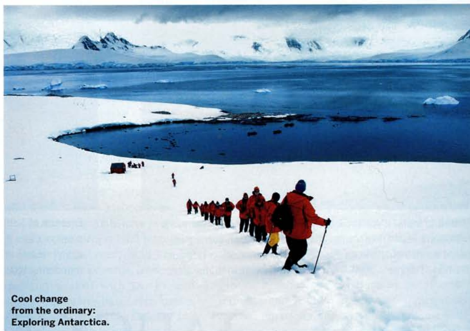
Cool change from the ordinary: Exploring Antarctica.

Antarctica may be the closest we can get to experiencing a different planet. A place where the sun rises in the fall and sets in March – one long day and night each year – it is our least explored continent, as well as our highest, driest, and, yes, our coldest too. As far as scientists know, no native peoples have ever lived there. This sense of the unknown and the chance to see rare adaptive wildlife, including emperor penguins, make travel to Antarctica a remarkable experience. Abercrombie & Kent was among the first tour operators to venture there 20 years ago; as part of that anniversary, its 14-day philanthropic tour on the eco-friendly Le Boreal includes a meeting with scientists at the Palmer research station to better understand this fragile habitat. Departures: December 7, 2011 and 2012; from $12,065.