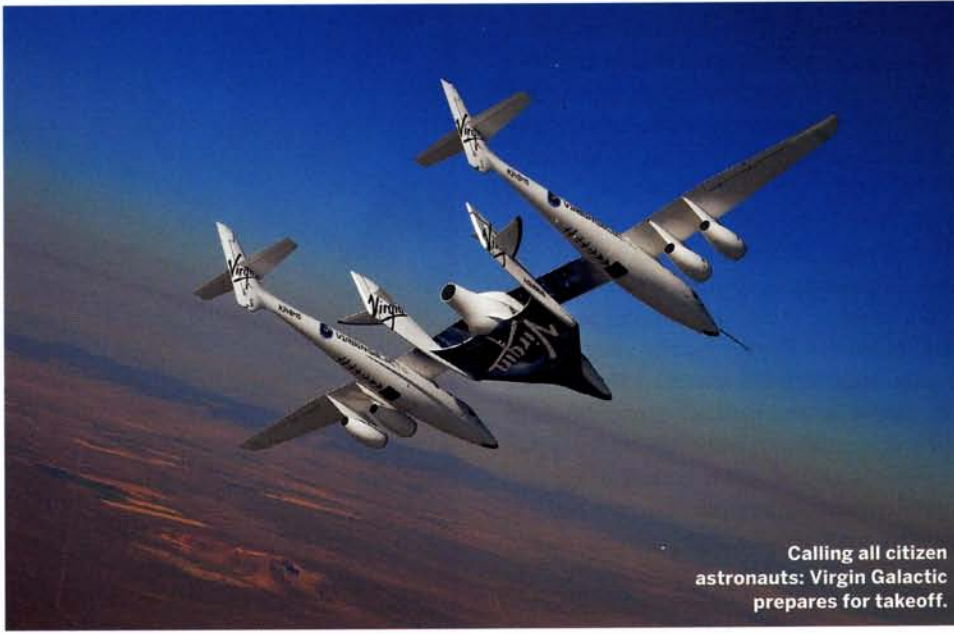
Calling all citizen astronauts: Virgin Galactic prepares for takeoff.

primary mode of transport for villagers at Lake Hövsgöl on the Siberian border, where you will hike through wildflower meadows beneath 10,000-foot mountain peaks and bed down in a ger camp, the way locals have for centuries. Departures: Any day from June through September 2012; from $5,580.