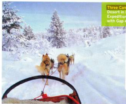
Three Camel Lodge, in the Gobi Desert in Mongolia, part of a Nomadic Expeditions trip. Left: Dog-sledding with Gap Adventures in Finland.